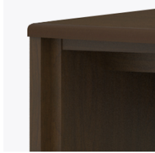
Waterfall Edging on Top

Kwalu's proprietary finish doesn't have any of the drawbacks of wood. The finish is moisture impervious, easy to clean and maintenance-free.