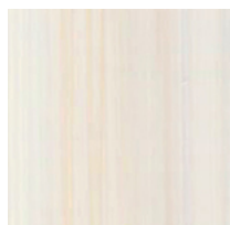
Wood Ash (Fusion)