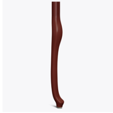
Optional Wheelchair Height

Kwalu's solid surface (1/8" thick) proprietary finish doesn't have any of the drawbacks of wood. The frames are moisture impervious, graffiti-resistant, easy to clean and maintenance-free.