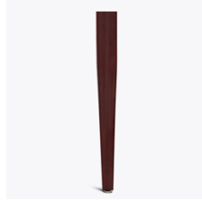
Optional Leg Style

Wheelchair height table legs are available and are optional.