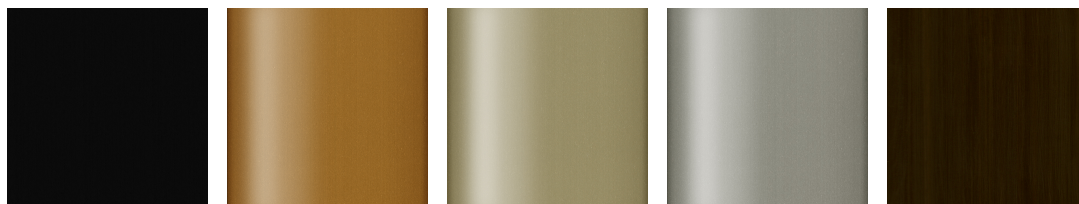
Premium Black (Classic)