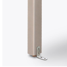
Optional Floor Mounting

Optional swivel casters may be added to the left side of the table only.