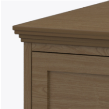
Reverse OG Edging on Top

The kit and instructions for wall mounting are included with this product. The wall mount instructions provided must be followed carefully for a secure, durable, and long-lasting solution to ensure the safety of the unit and the user.