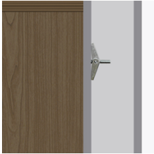
Wall Mount Hardware

Kwalu’s proprietary finish doesn’t have any of the drawbacks of wood. The finish is moisture impervious, easy to clean and maintenance-free.