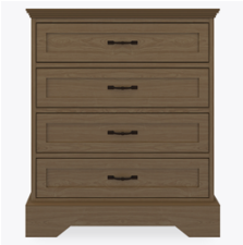
Other Chest Styles

Choose from dozens of hardware styles, including ADA compliant options.