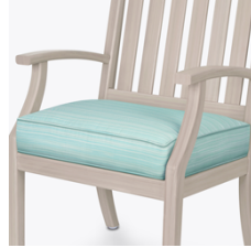
Optional Piping on Seat

Kwalu's quick drying cushion construction moves moisture through fast allowing cushions and pillows to dry rapidly.