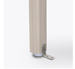
Optional Floor Mounting

Please contact a sales associate to purchase additional or replacement cushions.