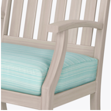
Waterproof Outdoor UV Protected Frame

Special additive protects frame against the elements and damaging ultraviolet rays.