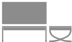
Via Coffee Table, Rectangular Top Model: VIBOA 44W 22D 16H