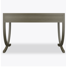
Other Table Styles

Kwalu's proprietary finish doesn't have any of the drawbacks of wood. The finish is moisture impervious, easy to clean and maintenance-free.