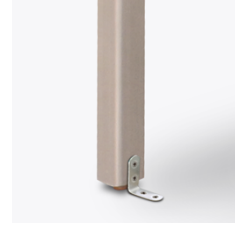
Optional Floor Mounting

Optional swivel casters may be added to the left side of the table only.