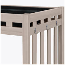
Waterproof Outdoor UV Protected Frame

Special additive protects frame against the elements and damaging ultraviolet rays.