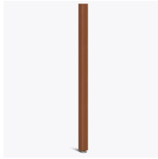
Optional Wheelchair Height

Kwalu's solid surface (1/8" thick) proprietary finish doesn't have any of the drawbacks of wood. The frames are moisture impervious, graffiti-resistant, easy to clean and maintenance-free.