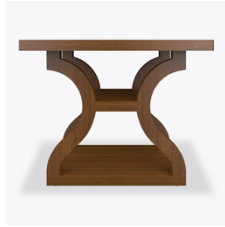
Other Table Styles

Kwalu's proprietary finish doesn't have any of the drawbacks of wood. The finish is moisture impervious, easy to clean and maintenance-free.