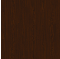
Natural Mahogany (Fusion)