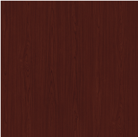
African Mahogany (Fusion)