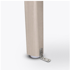
Optional Floor Mounting

Please contact a sales associate to purchase additional or replacement cushions.