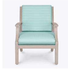
Number of Seats

Piping available on back pillows and seat cushions and is optional.