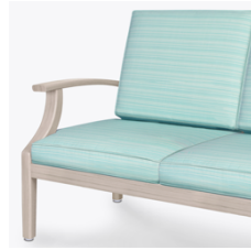
Optional Piping on Back Pillow and Seat

Kwalu's quick drying cushion construction moves moisture through fast allowing cushions and pillows to dry rapidly.