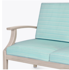
Quick Dry Cushion

Our patented steel-reinforced joint system uses over 20 pieces of steel in most Kwalu chairs. Stop ongoing and costly furniture replacement.