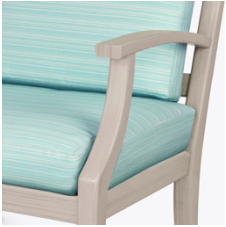
Waterproof Outdoor UV Protected Frame

Special additive protects frame against the elements and damaging ultraviolet rays.