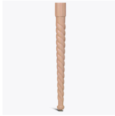
Optional Wheelchair Height

Kwalu's solid surface (1/8" thick) proprietary finish doesn't have any of the drawbacks of wood. The frames are moisture impervious, graffiti-resistant, easy to clean and maintenance-free.