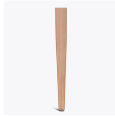
Optional Leg Style

Wheelchair height table legs are available and are optional.