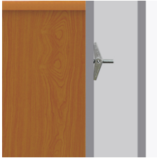
Wall Mount Hardware

Kwalu’s proprietary finish doesn’t have any of the drawbacks of wood. The finish is moisture impervious, easy to clean and maintenance-free.