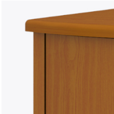
Waterfall Edging on Top

The graceful curved front is a signature Camelot feature.