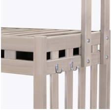
Waterproof Outdoor UV Protected Frame

Special additive protects frame against the elements and damaging ultraviolet rays.