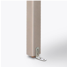
Optional Floor Mounting

Optional swivel casters may be added to the left side of the table only.