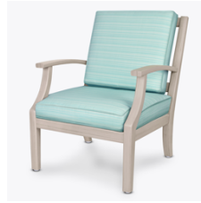
Optional Piping on Back Pillow and Seat

Kwalu's quick drying cushion construction moves moisture through fast allowing cushions and pillows to dry rapidly.