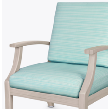
Quick Dry Cushion

Our patented steel-reinforced joint system uses over 20 pieces of steel in most Kwalu chairs. Stop ongoing and costly furniture replacement.