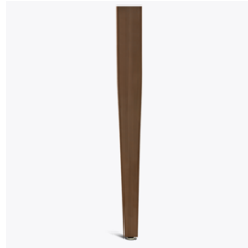
Optional Wheelchair Height

Kwalu's solid surface (1/8" thick) proprietary finish doesn't have any of the drawbacks of wood. The frames are moisture impervious, graffiti-resistant, easy to clean and maintenance-free.