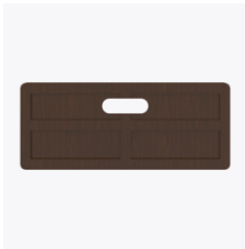
Optional Router Out for Control Panels

Optional factory pre-drilling is available. Template must be provided by customer when this feature is selected.