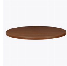
Compatible Table Tops

Wheelchair height base is available and is optional.