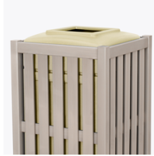
Optional Liner Color

Available with top load or optional side load lids.