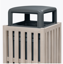
Optional Lid Style

Special additive protects frame against the elements and damaging ultraviolet rays.