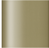
Premium Soft Gold (Classic)