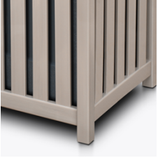
Waterproof Outdoor UV Protected Frame

Special additive protects frame against the elements and damaging ultraviolet rays.