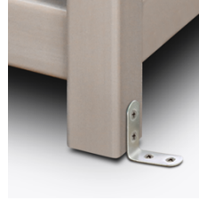
Optional Floor Mounting

42 gallon liner in grey is provided. The liner in beige is optional.