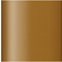
Premium Pure Copper (Classic)