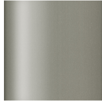
Premium Platinum (Classic)