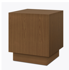
Optional Kwalu Top

Corian®/ Hanex®/ Krion® tops, .5" waterfall edged, are available only on the end tables of the collection.