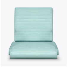
Quick Dry Cushion

Kwalu's quick drying cushion construction moves moisture through fast allowing cushions and pillows to dry rapidly.