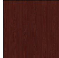
African Mahogany (Fusion)