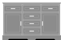
Dorchester Credenza Station – 48"W Model: DOBF62S48 48W 18D 32H