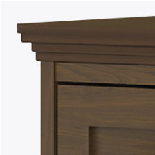
Reverse OG Edging on Top

Kwalu’s proprietary finish doesn’t have any of the drawbacks of wood. The finish is moisture impervious, easy to clean and maintenance-free.