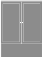
Lancaster Media Storage Hutch with Doors – 36”W Model: LAMCH02S 36W 10D 48H