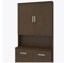
Coordinates with Media Storage Base

Unit includes adjustable enclosed shelves.