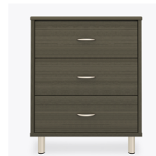
Optional Narrower Version

Raised on rust proof aluminum feet to allow ease of cleaning beneath casework.