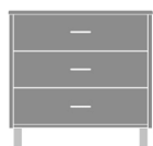
Atlanta II Chest Wide, 3 Drawers Model: A2CH30W 31.75W 18.5D 30H