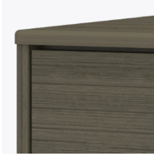
Waterfall Edging on Top

Kwalu's proprietary finish doesn't have any of the drawbacks of wood. The finish is moisture impervious, easy to clean and maintenance-free.