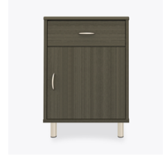
Other Bedside Styles

A top drawer lock is available and is optional.