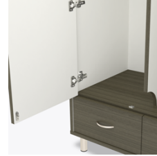
Hidden Door Latch

Lighter colored interior helps with spatial orientation.