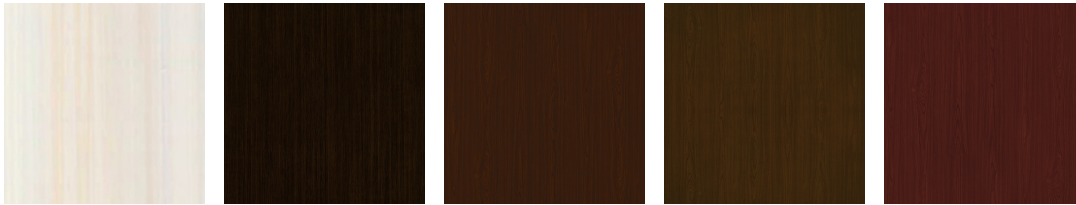
Wood Ash (Fusion)