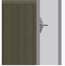
Wall Mount Hardware

Kwalu's proprietary finish doesn't have any of the drawbacks of wood. The finish is moisture impervious, easy to clean and maintenance-free.