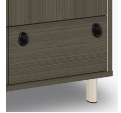
Passive Locks on Drawers

Hidden door latch allows caregivers exclusive access.