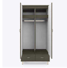
Contrasting Interior Finish

Waterfall edging creates continuous smooth surface for easy cleaning.