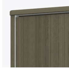
Waterfall Edging on Top

The kit and instructions for wall mounting are included with this product. The wall mount instructions provided must be followed carefully for a secure, durable, and long-lasting solution to ensure the safety of the unit and the user.