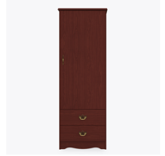
Other Wardrobe Styles

Choose from dozens of hardware styles, including ADA compliant options.