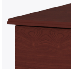
OG Edging on Top

The kit and instructions for wall mounting are included with this product. The wall mount instructions provided must be followed carefully for a secure, durable, and long-lasting solution to ensure the safety of the unit and the user.