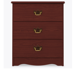
Other Chest Styles

Choose from dozens of hardware styles, including ADA compliant options.