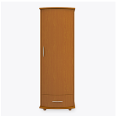
Other Wardrobe Styles

Standard clothing rod may be attached at ADA height of 48" from the floor.