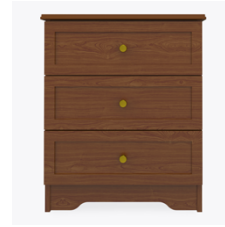
Optional Narrower Version

Are constructed with both dowel and mechanical fasteners for additional strength. 100lb static and dynamic load Euro Drawer Slides allow for easy opening and closing.