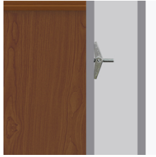
Wall Mount Hardware

Kwalu's proprietary finish doesn't have any of the drawbacks of wood. The finish is moisture impervious, easy to clean and maintenance-free.