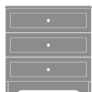
Lancaster Chest Wide, 3 Drawers Model: LACH30W 31.5W 19D 30H