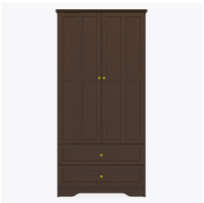
Other Wardrobe Styles

Standard clothing rod may be attached at ADA height of 48" from the floor.