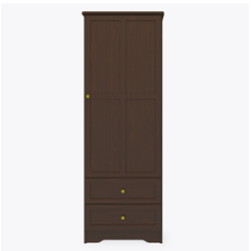
Other Wardrobe Styles

Standard clothing rod may be attached at ADA height of 48" from the floor.