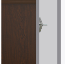
Wall Mount Hardware

Kwalu's proprietary finish doesn't have any of the drawbacks of wood. The finish is moisture impervious, easy to clean and maintenance-free.