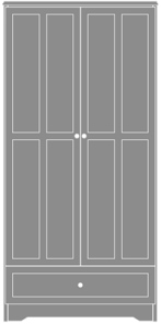
Mission Double Wardrobe, 1 Drawer, 2 Doors Model: MIWR12 34.5W 23.75D 71H