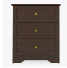
Optional Narrower Version

Are constructed with both dowel and mechanical fasteners for additional strength. 100lb static and dynamic load Euro Drawer Slides allow for easy opening and closing.