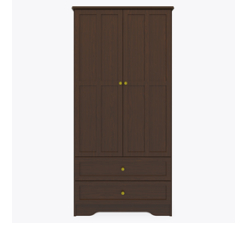
Other Wardrobe Styles

Standard clothing rod may be attached at ADA height of 48" from the floor.