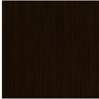
Midnight Oak (Fusion)