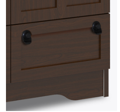
Passive Locks on Drawers

Hidden door latch allows caregivers exclusive access.