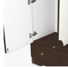
Hidden Door Latch

Lighter colored interior helps with spatial orientation.