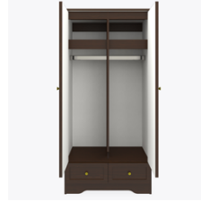
Contrasting Interior Finish

The raised overlay on this collection adds a classic style feature.