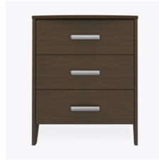
Other Chest Styles

Are constructed with both dowel and mechanical fasteners for additional strength. 100lb static and dynamic load Euro Drawer Slides allow for easy opening and closing.