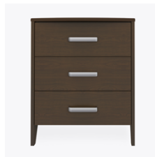
Other Chest Styles

Are constructed with both dowel and mechanical fasteners for additional strength. 100lb static and dynamic load Euro Drawer Slides allow for easy opening and closing.