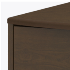
Waterfall Edging on Top

The kit and instructions for wall mounting are included with this product. The wall mount instructions provided must be followed carefully for a secure, durable, and long-lasting solution to ensure the safety of the unit and the user.