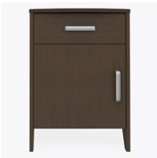
Other Bedside Styles

A top drawer lock is available and is optional.