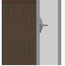
Wall Mount Hardware

Kwalu's proprietary finish doesn't have any of the drawbacks of wood. The finish is moisture impervious, easy to clean and maintenance-free.