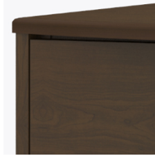
Waterfall Edging on Top

The kit and instructions for wall mounting are included with this product. The wall mount instructions provided must be followed carefully for a secure, durable, and long-lasting solution to ensure the safety of the unit and the user.