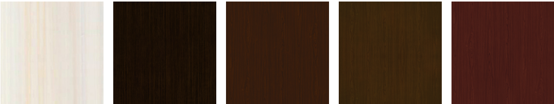
Wood Ash (Fusion)