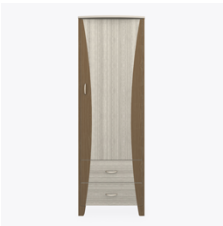
Other Wardrobe Styles

Choose from dozens of hardware styles, including ADA compliant options.