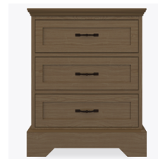
Other Chest Styles

Choose from dozens of hardware styles, including ADA compliant options.