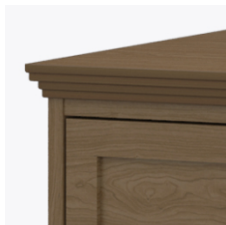
Reverse OG Edging on Top

The kit and instructions for wall mounting are included with this product. The wall mount instructions provided must be followed carefully for a secure, durable, and long-lasting solution to ensure the safety of the unit and the user.