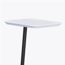
Corian®/ Hanex®/ Krion® Top

Table features a 1" solid surface top with elliptical edge detailing.