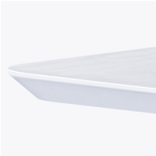
Elliptical Edge Detail on Top