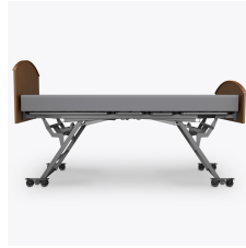
Vertical Lift to Caregiver Height

The floor-level function lowers the mattress platform to a height of 4 in above the floor, helping to reduce the risk of falls and associated injuries.