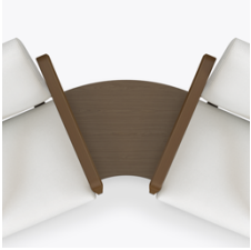
Optional Kwalu Top

Available with a 1.5" Top made of Kwalu's proprietary material.