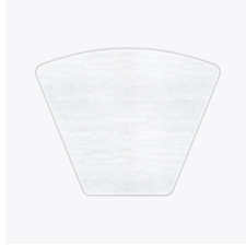
Optional Rounded Corners Top

Available with a 1.5" Top made of Kwalu's proprietary material.