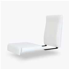
Back Cushion and Seat Cushion are Field Replaceable

Cleanout prevents buildup of debris and provides for easy maintenance.