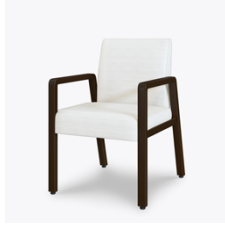
Optional Flex Short Back

Frame enables a modest amount of flexibility in the back only; seat, arms and legs remain stationary.