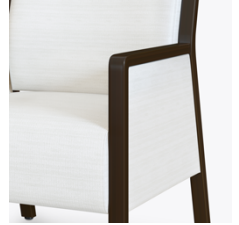
Optional Closed Arm Panels

Choose from 3 seat styles – lounge chair, love seat, and sofa.