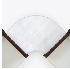
Optional Curved Shape

Available with a 1.5" Top made of Kwalu's proprietary material.