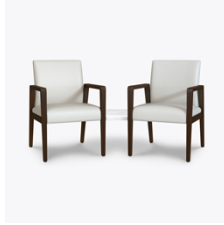
Other Table Styles

The linking table is available in a curved shape to better fit a curved space and is optional.