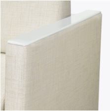
Optional Corian®/Hanex®/Krion® Arm Caps

Formed and fitted solid surface arm caps are available and optional.