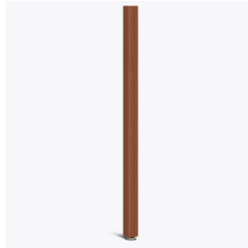
Optional Wheelchair Height

Kwalu's solid surface (1/8" thick) proprietary finish doesn't have any of the drawbacks of wood. The frames are moisture impervious, graffiti-resistant, easy to clean and maintenance-free.