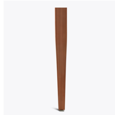
Optional Leg Style

Wheelchair height table legs are available and are optional.