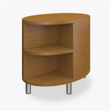
Optional Kwalu Top

Corian®/ Hanex®/ Krion® tops, .5" waterfall edged, are available only on the end tables of the collection.