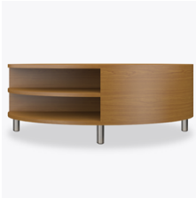
Other Table Styles

Available with a top made of Kwalu's proprietary material.