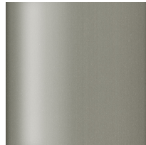
Premium Platinum (Classic)