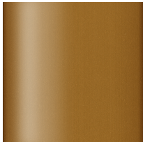
Premium Pure Copper (Classic)