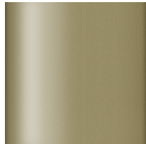
Premium Soft Gold (Classic)