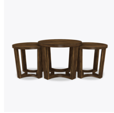
Two heights allow for nesting option

Optional .5" waterfall edged Corian®/ Hanex®/ Krion® tops are available on the end tables of the collection only.