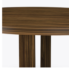
Optional Corian®/ Hanex®/ Krion® Top

Collection includes coffee and end tables.