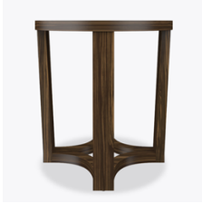
Other Table Styles

Kwalu's proprietary finish doesn't have any of the drawbacks of wood. The finish is moisture impervious, easy to clean and maintenance-free.